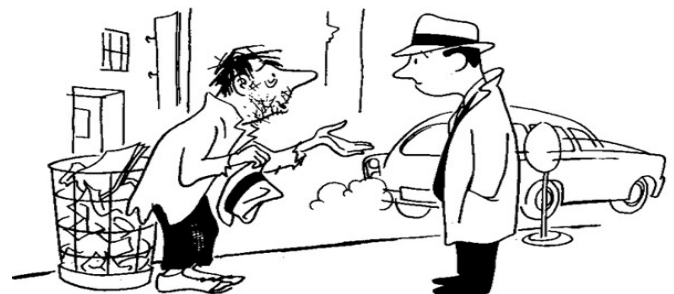
"Brother, can you spare a dime for a phone call -- in case I feel like taking a drink?"