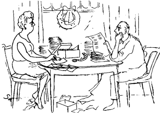
"Our Christmas list was certainly a lot easier to handle back when I had resentments!"

THE POLICE OFFICER had just handed him a ticket, but the drunk was belligerent. "What am I supposed to do with this?" he demanded. "Keep it," the police officer replied. "When you collect four of them, you get a bicycle." March 2001