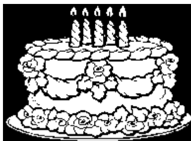
Birthday Gratitude To:

Many A.A. members celebrate their AA Birthday by sending a donation to Central Office. These donations help to keep the doors of the office open so that new members may receive the same help so many of us already have. Others make a quarterly donation, or simply make Personal Contributions. All donations are greatly appreciated.