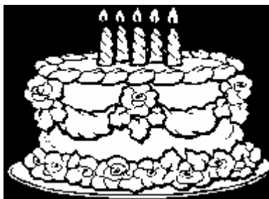
Birthday Gratitude To: