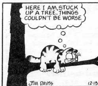
by Jim Davis