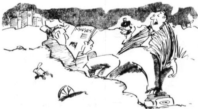
"Days of Wine and what?"