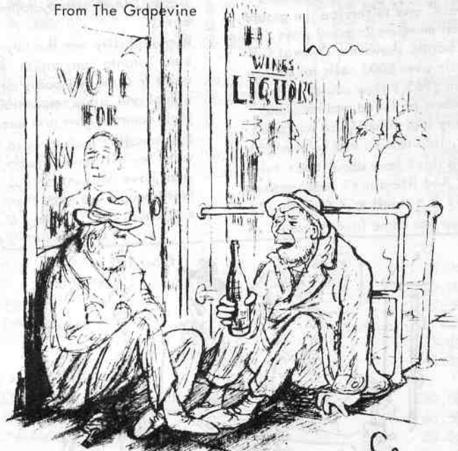
Our Social Life Before AA